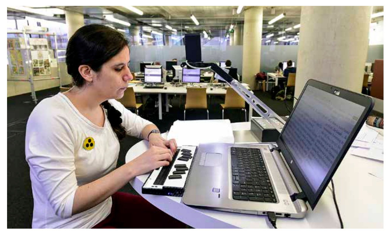
Promoting accessibility: the portal informs teachers about the range of services offered by the University of Freiburg, such as aids for students with a visual impairment.

But what is "diversity" actually all about? Germany's General Act on Equal Treatment prohibits discrimination based on these six characteristics: religion or belief, ethnic origin, disability, age, gender and sexual orientation. "In addition, there are further aspects that can determine academic success and performance or the lack of it - social background, for example," says