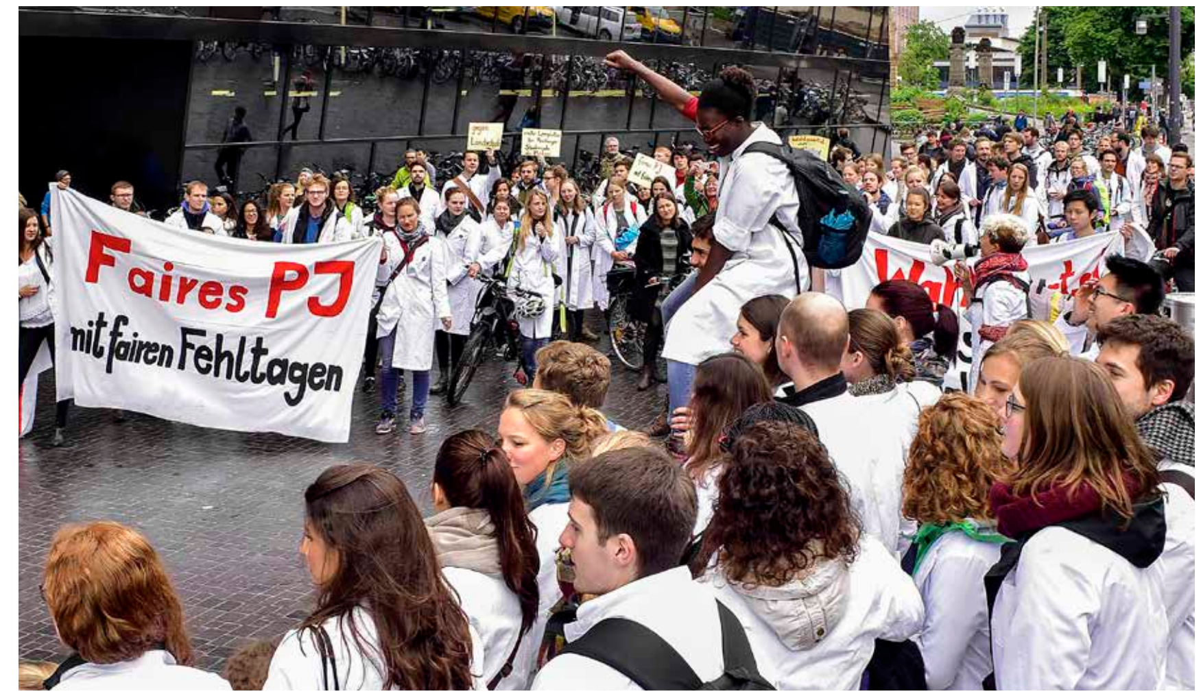
Was bewegt Menschen dazu, für ihre Ideale auf die Straße zu gehen? Für die Studie fragt das Team die Probanden, wie sie zu Bildung, Umwelt, Wirtschaft und Sicherheit stehen

We're doing some really complex experiments. First of all, we record the affective, reflexive reaction of our test subjects to the images that we show them. Then we observe how they cognitively process the affective reaction and whether this alters their readiness to take part in political protest. Communications science looks closely at the affective reaction. Political science, by contrast, examines intentional action. What's new is that we can bring the reflexive behavioral reaction together with intentional action.