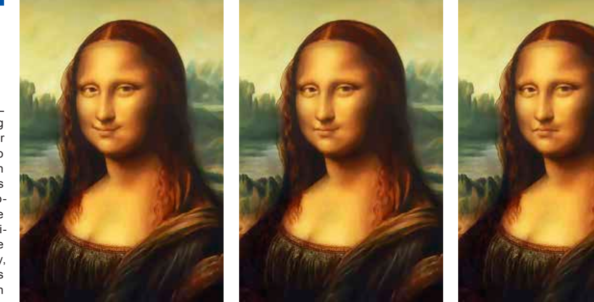
Is the Mona Lisa smiling or pouting? For their study, researchers manipulated the enigmatic expression one of the world's most famous faces.