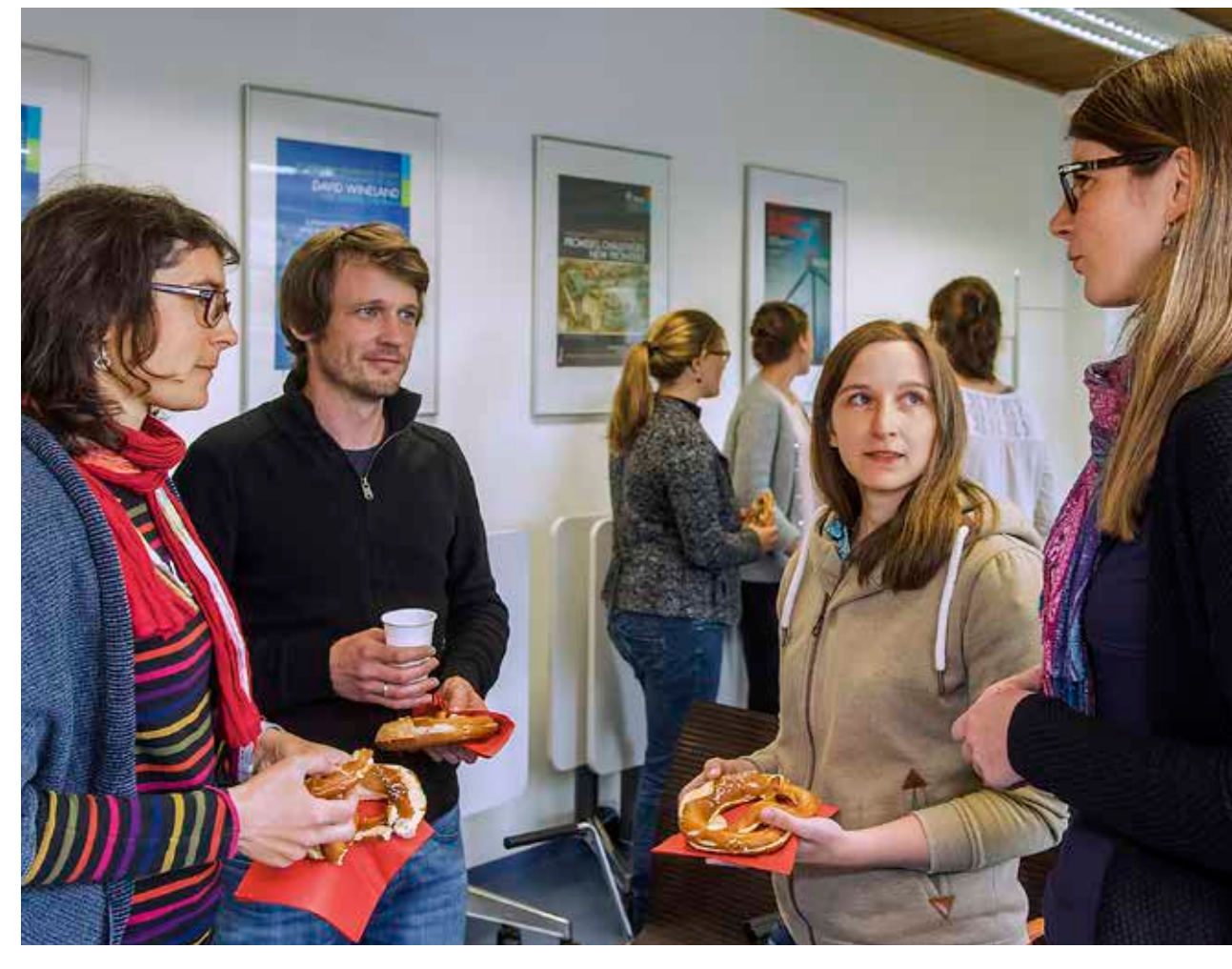
Enjoying lunch while learning: The new "brown bag" event format brings junior researchers together in a relaxed atmosphere while presenting topics about a research career path.

There is something in the program for everyone, whether it is assessing potential or workshops about establishing networks and beyond to activities addressing academic and non-academic career paths. Even the needs of experienced postdocs have been considered. There are sessions, for example, that cover making offers, provide advice on applying for thirdparty funding, and how to manage research projects or project staff. Some of the workshops last two days. Otherwise, the emphasis is on shorter